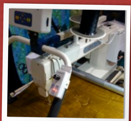
TIN LIZZIE AND QBOT ARE A GREAT FIT