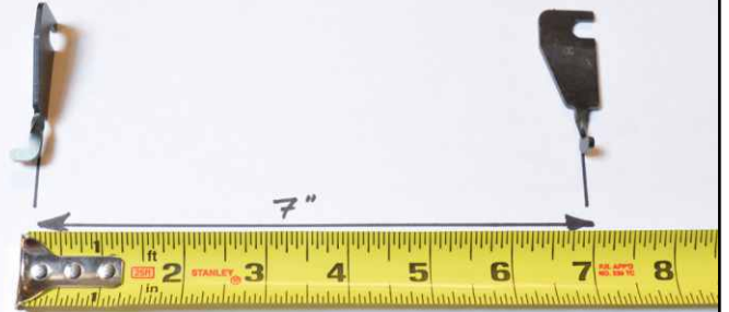
measuring the span between the drive wire holders

In this example, we are depicting an attachment point measurement of exactly 7". This is strictly for demonstration purposes so the entire span fits within a single photo.